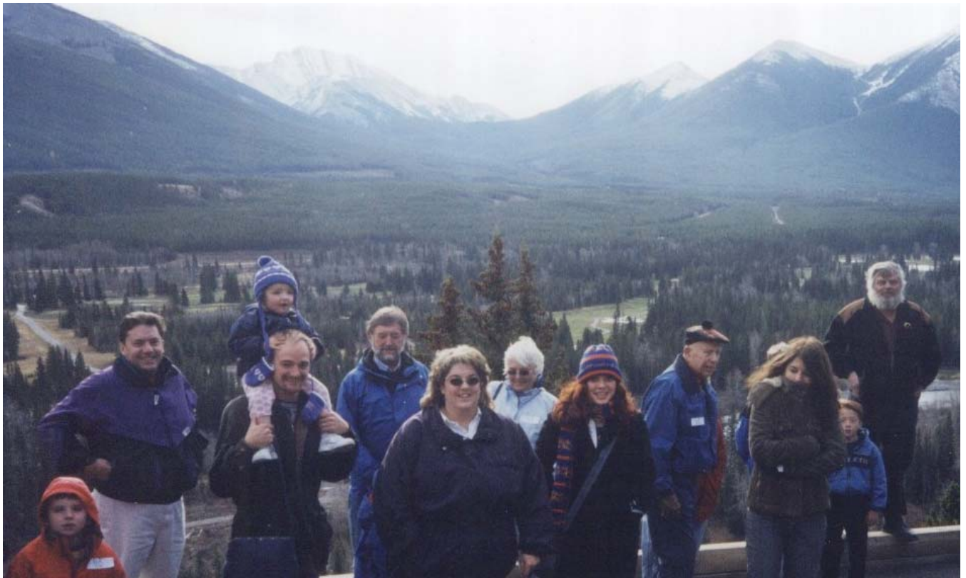
Members of the Family of Rotary from Pincher Creek, Calgary, Germany, Switzerland and Nakiska